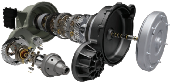
Transmission transfer case