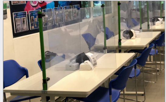
Break Room Table Dividers