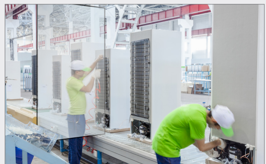
Manufacturing Line Clear and Opaque Partitions