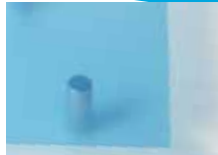
LC599-025 Translucent Blue