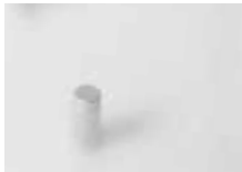
LC101-025 Translucent Clear