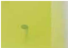
LC729-025 Translucent Yellow