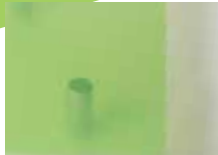
LC999-025 Translucent Green