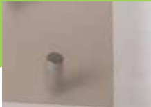
LC342-025 Translucent Smoke