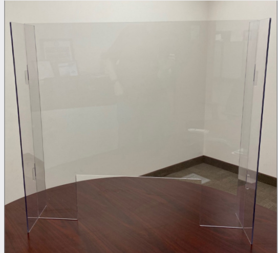
Easy to assemble, no tools required

Standard dimensions: 30 3/8" Wide x 32" Tall x 8" Deep