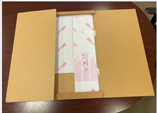
Barriers easily store flat and can be individually boxed or skid packed for bulk shipments