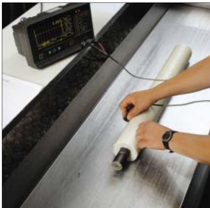
Each NYMETAL billet is inspected to ensure the highest quality.

The metal core provides optimum strength in the bore for power transmission and keyway integrity. All these advantages can be delivered at cost competitive prices.