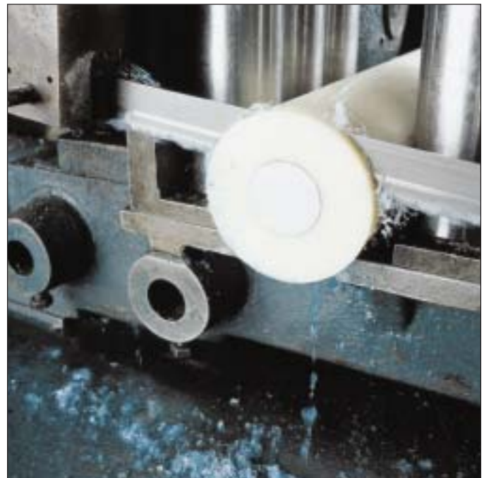
NYMETAL billets are saw cut prior to gear manufacturing.

NYMETAL billets can be manufactured into many different components, including gears of all types, rollers, sprockets, and augers. If you have a difficult power transmission